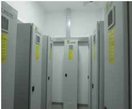
Isolated Power Systems