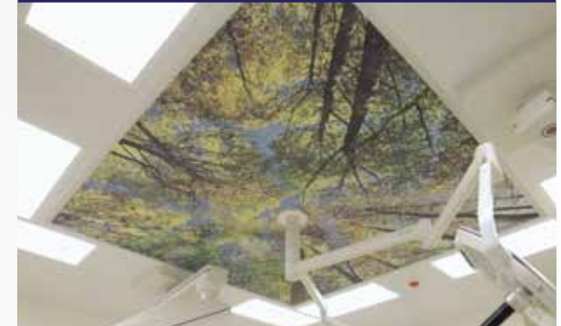
HYGIENE AIR CONDITIONING