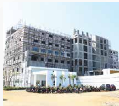
INTEGRATION & FINISHING