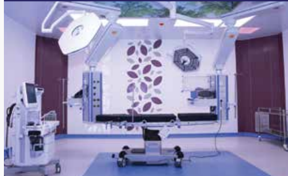
MODULAR OPERATION THEATRE