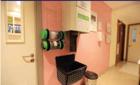
PNEUMATIC TUBE SYSTEMS