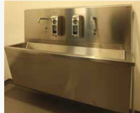
Surgical Scrub Sink