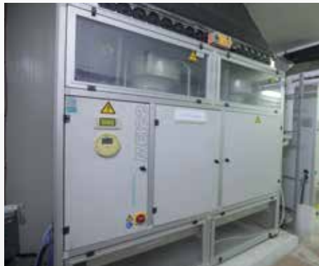
Air Handling Unit